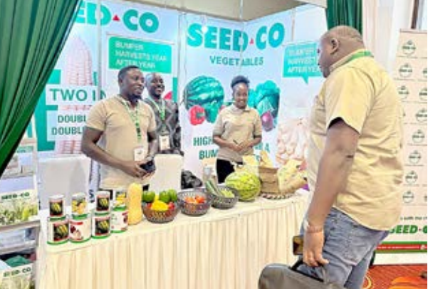
Exhibitors from Seed CO displaying their produce during the Africa Seed Trade Association (AFSTA) congress held at Pride Inn Paradise Resort, Mombasa.

"We encourage our farmers to plant new, clean, and certified seeds. Studies have shown that adopting and planting certified seeds can increase yields by one and a half times. This leads to poverty reduction and improved livelihoods, as farmers can produce enough to meet domestic consumption and have a surplus to sell," the CS said. Speaking at the AFSTA annual congress held in