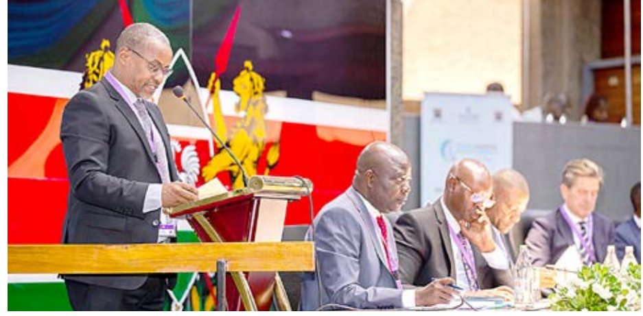
Zachariah Njeru, Cabinet Secretary for Water, Sanitation, and Irrigation during the 2024 Water and Sanitation Investors Conference (WASIC) in Nairobi.

The ministry is carrying out feasibility studies and designs of over 40 dams," DP