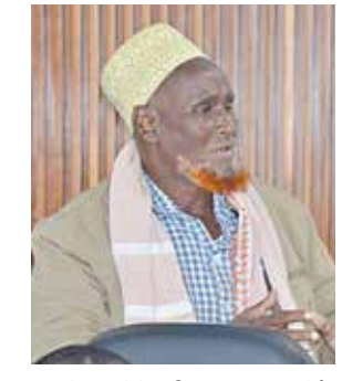
A clan elder from Marsabit County speaks during the meeting for reopening of Dabel Gold Mines.

We will continue to meet with leaders, communities, and stakeholders to chart a roadmap