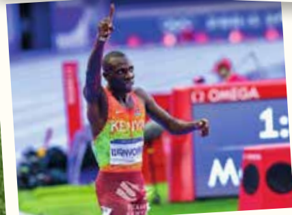
Emmanuel Wanyonyi won Gold in the Men's 800m race.