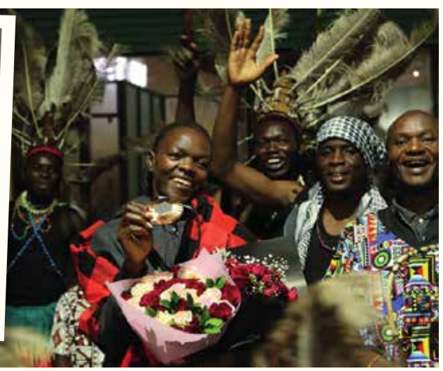
800m Olympic Bronze medalist Mary Moraa is welcomed back in Kenya.