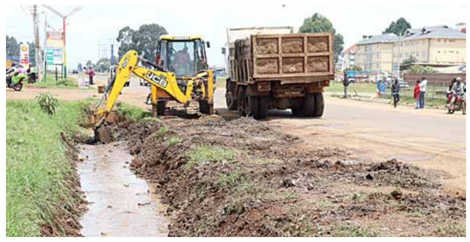
Ongoing opening of drainages in readiness for conferment of Eldoret to city status

The elevation of Eldoret to city status is long overdue. Its strategic location and facilities make