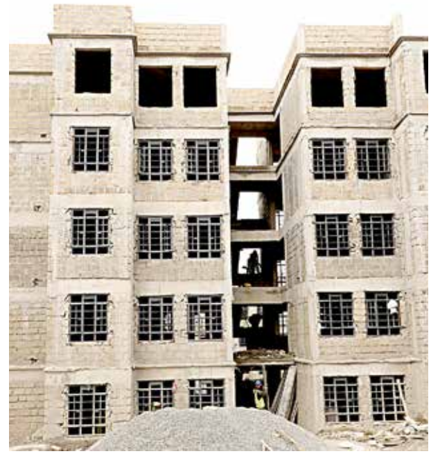
Affordable housing units under construction in Elburgon, within Molo Sub-County. Governor Susan Kihika has announced that the affordable housing projects in Molo and Bahati Sub-Counties are 60 pc complete.

Governor Kihika highlighted that job beneficiaries include mechanical engineers, plumbers, masons, steel fixers, carpenters, and welders. She added that the projects have served as a hub for