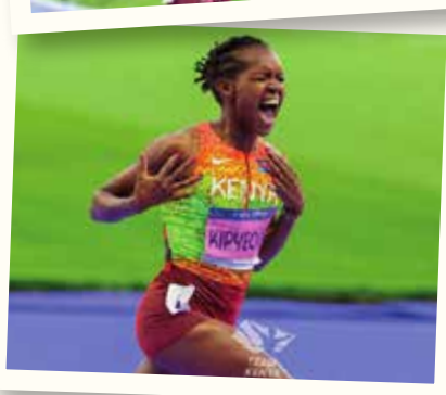
Faith Kipyegon won Gold in the Women's 1500m race, and Silver in the Women's 5000m race