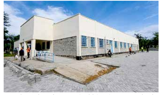
A sectional view of the Pap Onditi Sub-County Hospital in Nyakach Sub County constructed by the Kisumu County Government to treat accident victims and other emergencies.

"By operationalizing this hospital, all emergency cases involving accident victims from the region will