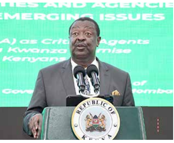
Prime Cabinet Secretary (CS) Musalia Mudavadi gives a keynote address during the conference to assess the status of the ongoing campaign to revitalise and re-energise regulatory authorities and agencies at Kenya School of Government (KSG), Mombasa.

He said that they had focused on shedding light and educating stakeholders on why businesses