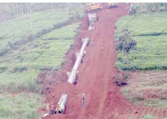
Installation of new water line from Ndakaini to Kirogo water treatment area going on.

He noted that the water pipes would replace those that are dilapidated and extend the area covered by the project. Kimotho urged the project's leadership to install water meters to ensure prudent water usage for the in-