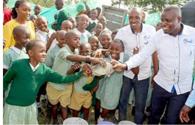
Pupils and staff from St. Agnes Muhoroni Primary School celebrate the output from the pond fish farming program supported by the ABDP that seeks to boost school feeding programme.

Abonyo urged regional schools to increase their resources for pond fish farming to maximize its benefits.