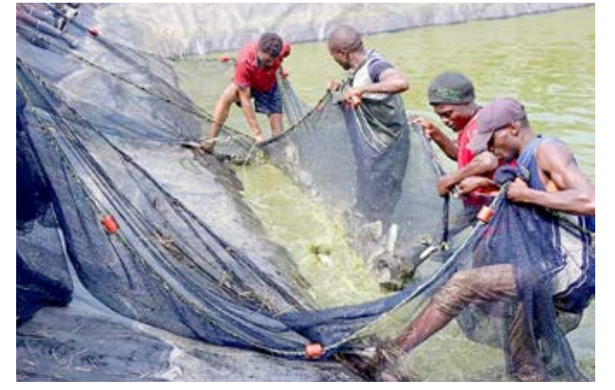
Fishermen harvesting fish at St. Agnes Muhoroni Primary School, Muhoroni Sub County from the school fish ponds. Some 278.14 Kilograms of tilapia fish was harvested.

lished a community-based resource center for learning about Competency Based Curriculum.