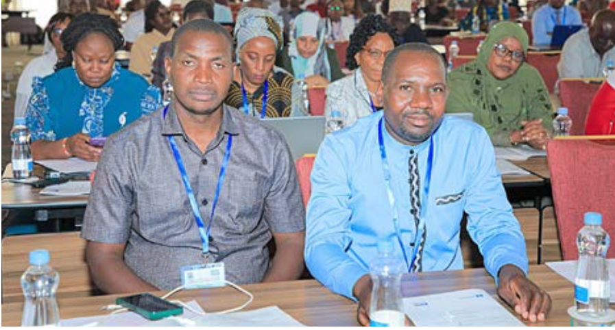
Some of the participants keenly following proceedings of the International East African Kiswahili Commission conference in Mombasa organized by the East African Commission on Kiswahili.

Article 119 of the EAC treaty states that partner states shall promote