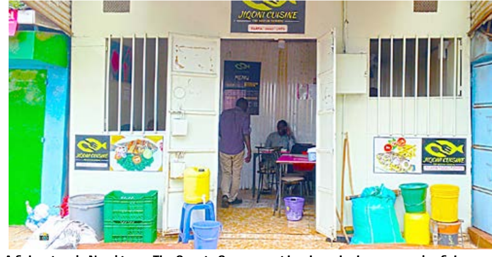
A fish eatery in Nyeri town. The County Government has launched an aggressive fish eating campaign aimed at integrating fish farming and consumption among the locals.

"If you look at Nyeri today, you can see a rise in the number of fish eateries in almost every town and street. This was not the case before. Today, major hotels in our towns also include fish on their menus. Most of the fish is sourced locally within the county, with some coming from other