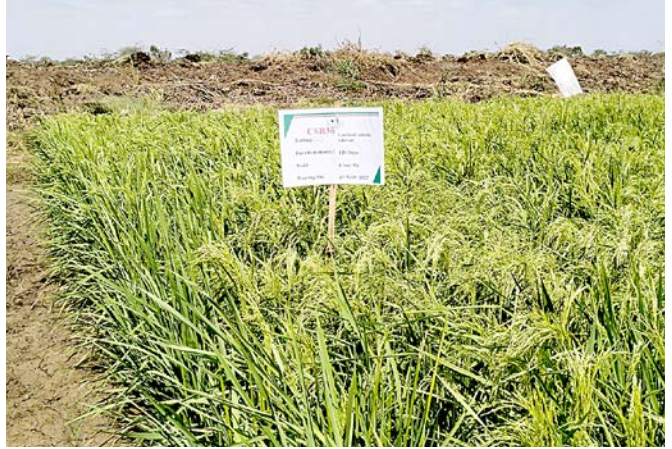
CSR36 rice variety at the demonstration farm at the Tana Irrigation Scheme during a rice stakeholder's field day.

smart and high yielding in that it, can be grown in saline-sodic soils (soils with pH levels more than 8.5). "The grains have long slender and aromatic attributes that match the consumer preference for milled white rice in Kenya.