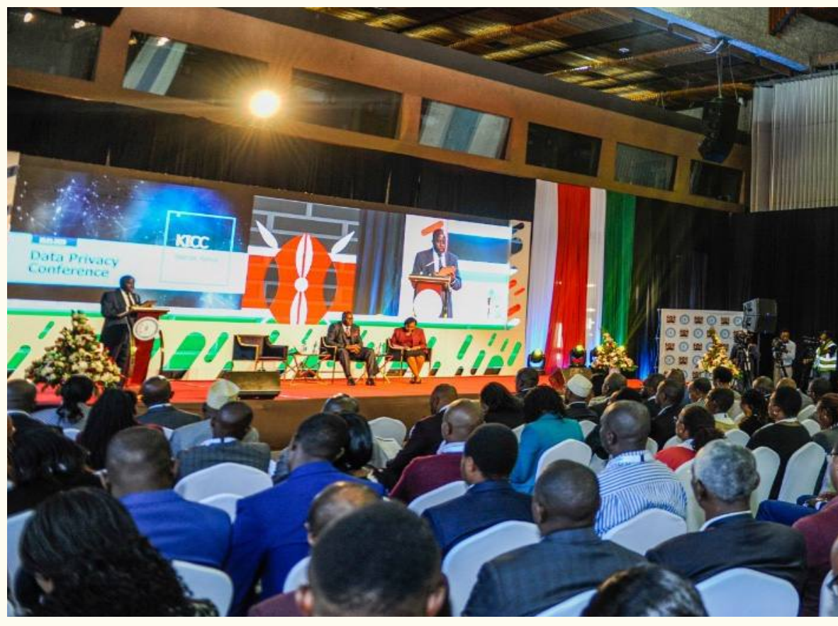
{\bf Participants\ follow\ proceedings\ at\ the\ data\ protection\ conference\ in\ Nairobi\ last\ week.}