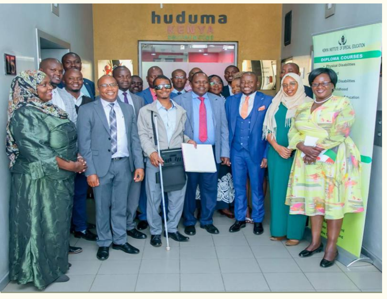
Huduma Kenya and KISE staff during their meeting on bettering services for the disabled at Huduma Centres.

Other areas Huduma Kenya and KISE agreed to partner are in deployment of sign language interpreters across the 52 Huduma Centres, translation of Huduma Kenya Programme Service Charter into Braille and Audio Visual, Deployment of Services to Huduma Centres, Contact Centre and Huduma Mashinani and Joint Awareness Campaigns,