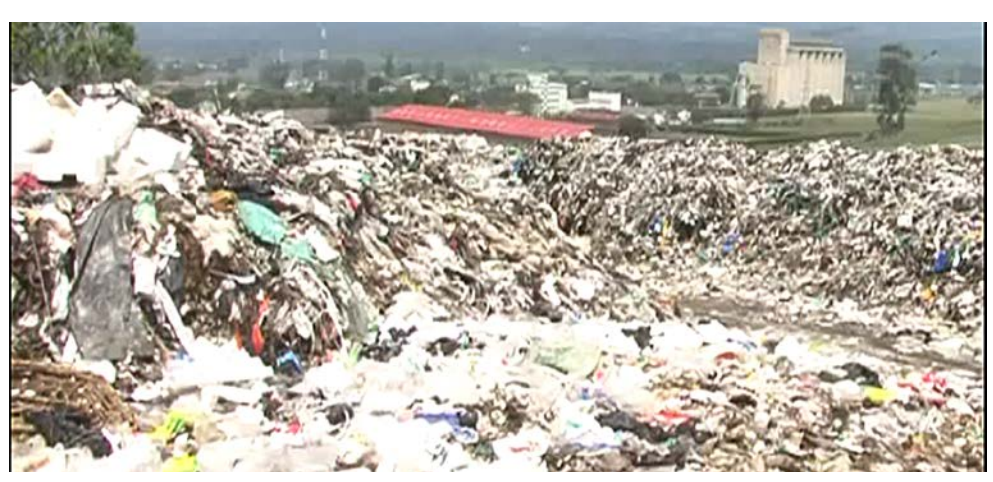
Giotto dump site in Nakuru.

According to an official report by the National Environmental Complaints Committee, an average of