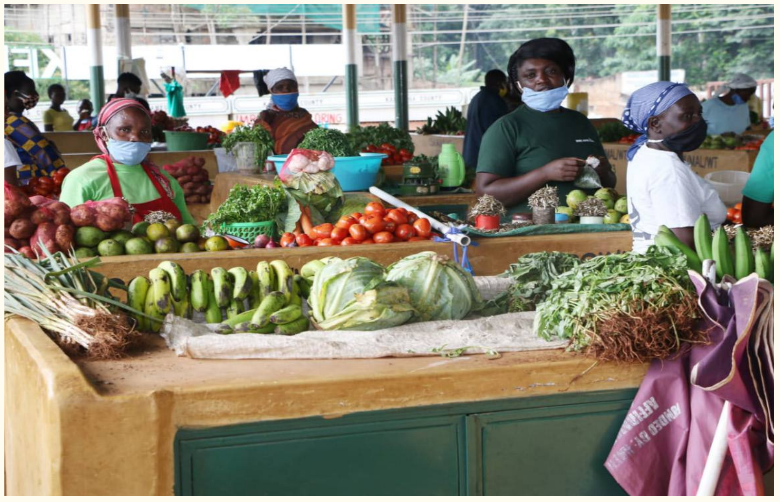
Fresh produce traders at Malinya market in Kakamega county. Such modern markets have helped boost hygiene and working conditions for traders.