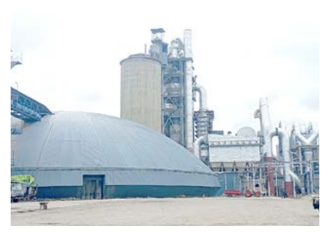
A side view of the Clinker Production Company at Sebit constructed by Devki Group of Companies in Kipkomo Sub County in West Pokot County.

opportunities across the country with all cement production companies in the country being assured of the availability of raw