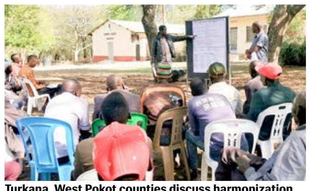
Turkana, West Pokot counties discuss harmonization of rangeland units.

The project is funded by Jon Snow Incorporation (JSI) through the United States Agency for International Development (USAID).