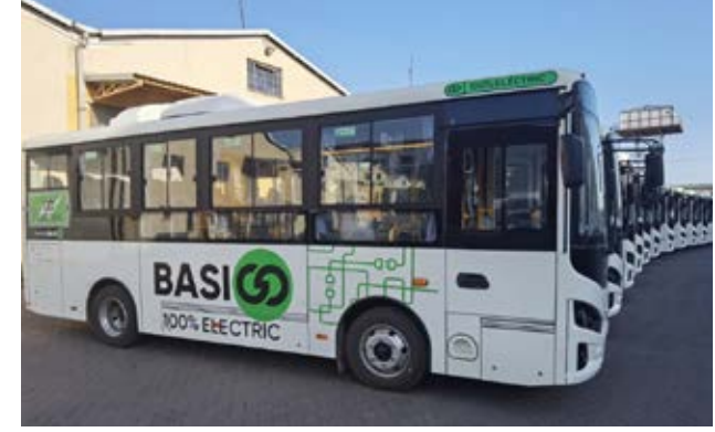
Electric buses on display at KVM

The startup, backed by CFAO, plans to expand its Pay-As-You-Drive financing model to include a wider range of commercial electric