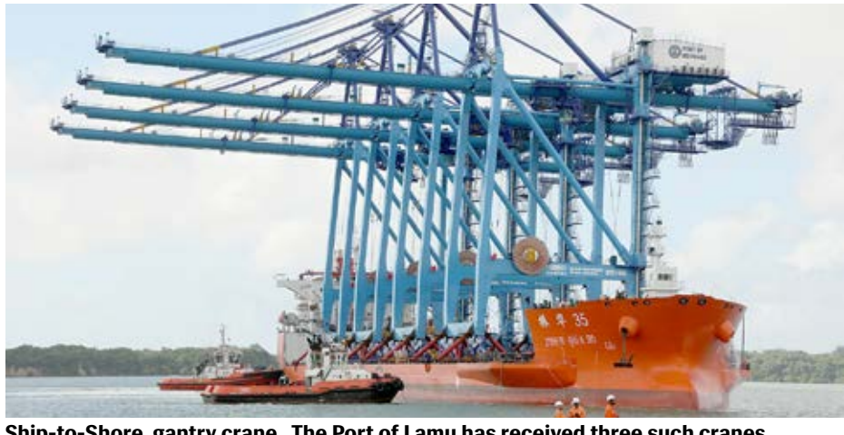
Ship-to-Shore gantry crane. The Port of Lamu has received three such cranes.

"What is happening in the red sea maybe bad but is also a blessing to the Port of Mombasa," Capt. Ruto