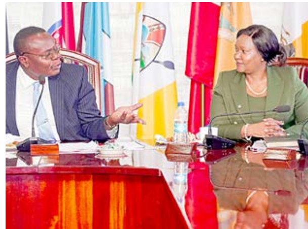
Gavana wa Kaunti ya Busia Dkt Paul Otuoma (kushoto) na Waziri wa Uwekezaji wa Biashara Rebecca Miano wakati wa mkutano wa mashauriano jijini Nairobi.

“Tumeanzisha majadiliano zaidi na kaunti zilizo