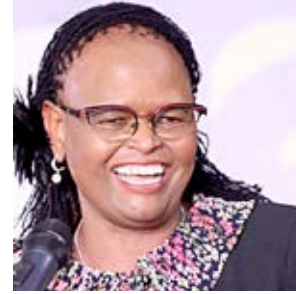
Jaji Mkuu Martha Koome

“Hili ni jambo la kupongezwa kwa sababu ushirikiano na uratibu katika kutoa huduma si tu wajibu wa kikatiba bali pia ni muhimu katika kuzingatia kuweka watu katikati ya shughuli zetu zote,” Jaji Mkuu alisema. Aliwataka wanachama