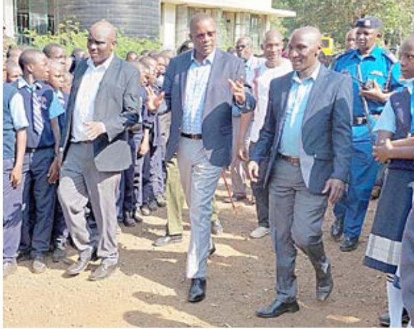
Waziri wa ICT Eliud Owalo akiwasili katika Shule ya Xaverian, Kisumu kwa zoezi la upandaji miti.

sishahi wa Mkakati wa Muda wa Kati wa Muhula wa IV mjini Kisumu, Waziri huyo alisema serikali inalenga kuweka kilomita 100,000 za kebo za intaneti ili kuongeza uunganisho wa intaneti.