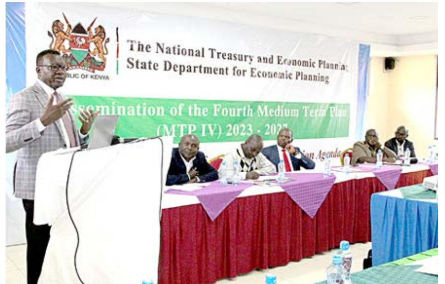
Waziri wa Kazi Davis Chirchir akizungumza wakati wa Mpango wa Nne wa Muda wa Kati (MTP IV) 2023-2027, katika ukumbi wa mikutano wa ACK huko Kericho

“Kwa hivyo, mara kwa mara nyakati za jioni, tunazima Kericho, kwa sababu hutumia nguvu nyingi, na tunazima mtambo kwa wakati mmoja; Kericho leo, kesho tunazima kwenda Kapkatet, na wakati mwingine kwa