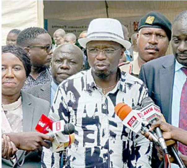
Waziri wa Masuala ya Vijana, Uchumi Ubumwima, na Michezo, Ababu Namwamba

uwanja wa Bukhundu, ambao alibaini kuwa utakamilishwa na serikali ya kitaifa kwa gharama ya zaidi ya Sh700 milioni, pamoja na Hospitali ya Kaunti ya Kakamega Level Six, ambayo ilianzishwa na kaunti lakini pia ikakwama katikati.