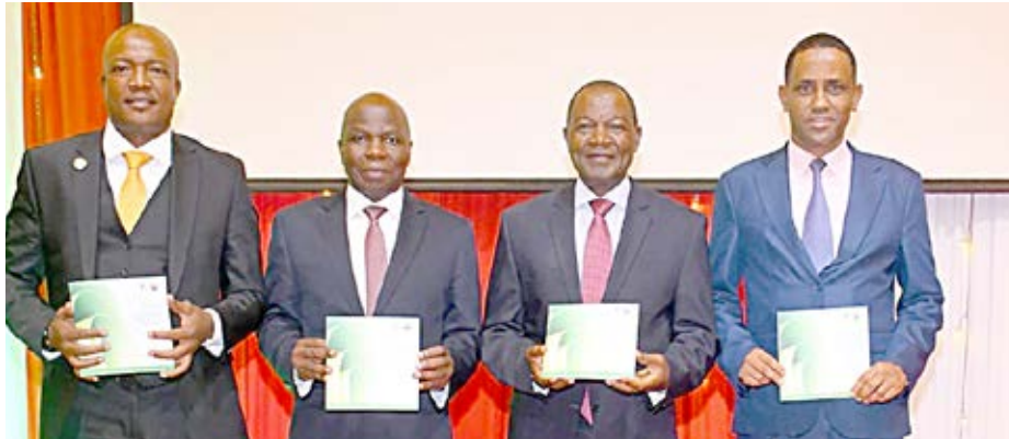
Waziri wa Hazina ya Kitaifa na Mipango ya Uchumi (CS) Prof Njuguna Ndung'u (Wa pili kutoka kulia) wakati wa uzinduzi wa mada ya sera ya idadi ya watu kwa maendeleo endelevu na Baraza la Kitaifa la Idadi ya Watu na Maendeleo (NCPD) mnamo Alhamisi Juni 6 2024 katika Safari Park, Nairobi.

Waziri wa Hazina alisema ukuaji wa idadi ya watu ni suala linalohitaji uchambuzi na usimamizi