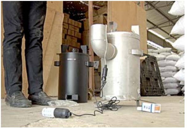
A thermo-electric Jiko that uses pellets to produce heat for cooking while at the same time produces energy to power light bulbs and charge phones,

also produced Jikos which were initially powered by pellets produced from sawdust to be pow-