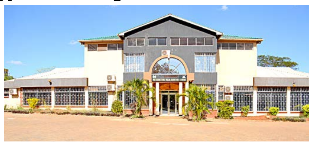
The Voi Gemstone Value Addition Center in Taita-Taveta County, that is poised to be commissioned by the end of February.

tal challenges, hope burns bright in the hearts of many dishevelled artisanal miners scattered across sev-