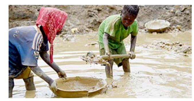
Children harvesting sand from a river an activity identified as one of the worst form of child labour in the World.

According to him, there are not enough programmes put in place by the government to help abused victims over-