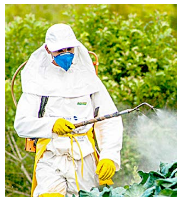
A farmer sprays his crops with pesticides (File).

The lobby group further said such pesticides (currently banned in EU countries) have been linked to increased cases of cancer, disruption of hormonal and nervous systems and genetic defects in unborn