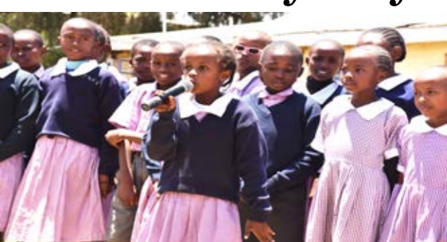
School children sing during the International Literacy Day

Culture encouraged those present to explore the vast knowledge available within the library's extensive collection and underlined the enduring impact of books and reading on the lives of