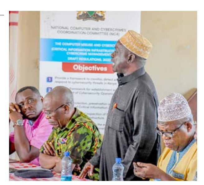
A member of the public gives his views on the Computer Misuse and Cybercrimes (critical information infrastructure and cybercrime management) 2023 draft regulations.

The regulations also provide for sensitization and capacity-building