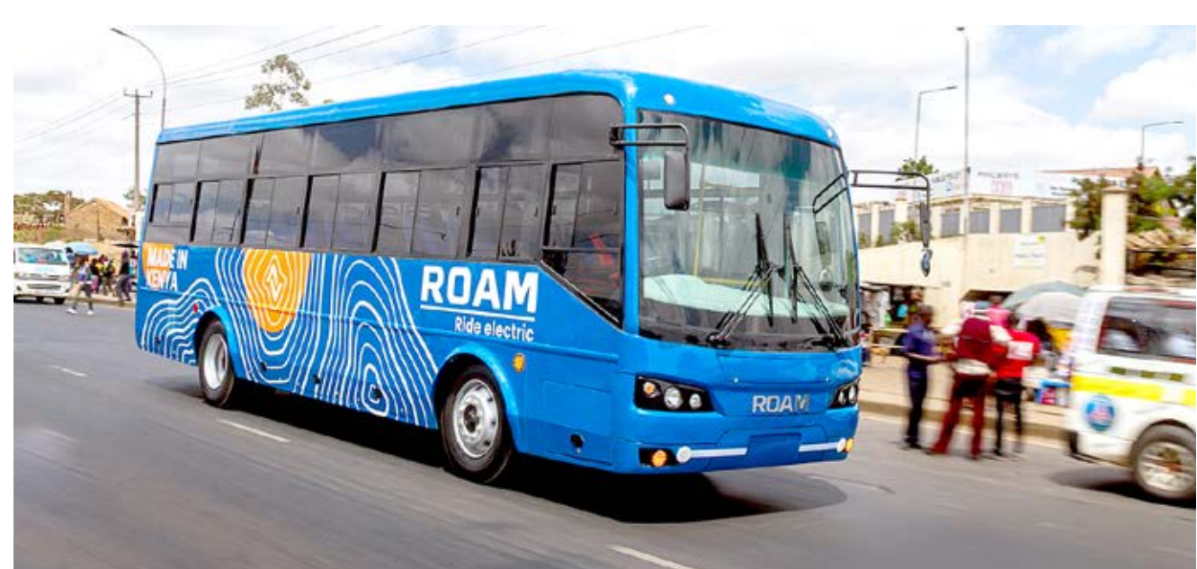
"Roam Move", the first fully locally assembled electric shuttle bus on the move in Nairobi.