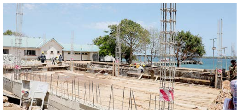
Construction works of the new Shimoni fish port project is gathering pace.

tails a modern jetty, a warehouse, a fish processing plant, cold storage, ice making plant, port access road and commercial port gate among other critical port facilities.