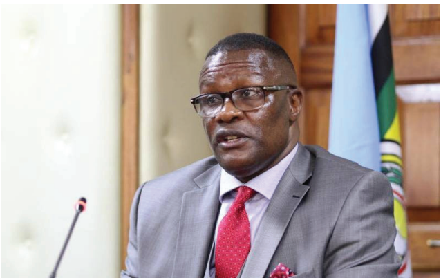
CS Eliud Owalo

projects had been approved for implementation during the second year of the development program among them, preliminary feasibility study for an Intelligent Transport System (ITS) and Integrated Control