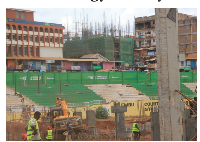
The ongoing construction works at Embu stadium