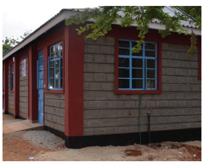
A glimpse at the modern dining hall funded by NFDK at Mwanyambo Special School for the deaf.

programs and procuring learning items for special