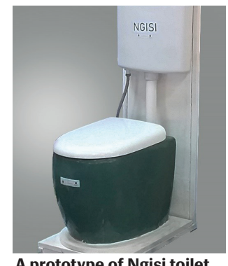
A prototype of Ngisi toilet produced by KBRC

The KBRC, domiciled in the State Department for Public Works under the Ministry of Lands, Public Works, Housing and Urban Development is mandated to undertake and facilitate