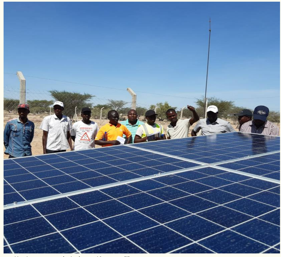
Monthly solar power generation has increased from 7.44 million kilowatts per hour (KWh) in 2021 to an average of 27KWh currently.