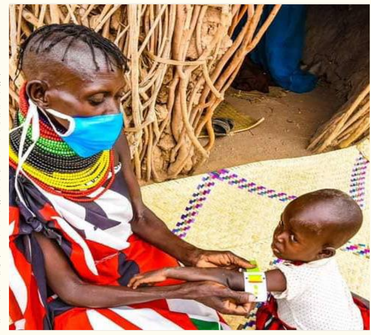
Most of the children affected in the dry areas are under five years.

Acute malnutrition risks across the counties are 970.214 children aged 6 to 59 months and 142,179 pregnant and breastfeeding mothers, who are equally in need of treatment.