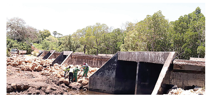
Construction works of the new Funzi island causeway project in Kwale gathers pace.

as the sole link between Funzi Island and Kwale mainland, accommodating pedestrians, cyclists, and vehicles servicing the island's tourism attractions