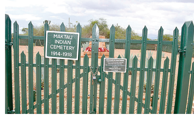
Maktau Commonwealth Cemetery where soldiers of Indian descent who died during the war are buried.

He argues that such a move would be a positive step towards atoning for the historical injustice and human-rights violations meted out to the local residents by the foreign combatants. However, he points out the urgent need to protect dozens of historical sites that are being degraded by weather, vandalism, and other adverse human activities.