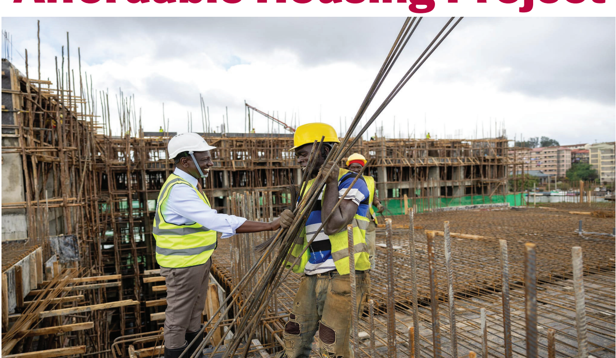
President William Ruto tours the Soweto Zone B Housing Project in Langata, Nairobi, to assess progress of the construction of affordable housing units adjacent to the sprawling Kibra slum.