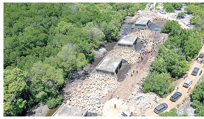
An aerial view of the iconic Funzi causeway project in Kwale taking shape at an unparalleled speed to boost connectivity and safety.