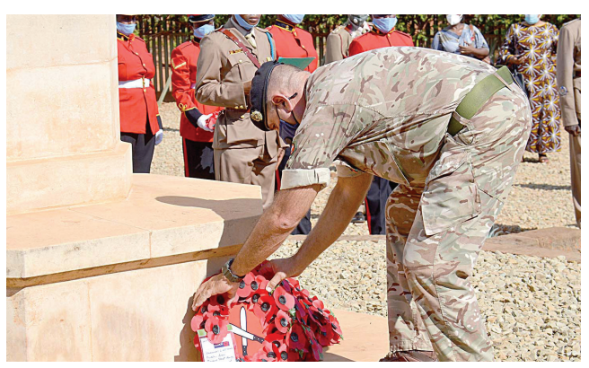
A British Army soldier lays a wreath at Voi Commonwealth War Graves during a past event to commemorate soldiers who died during WW1.

tourism promoters regard these decaying relics of war as an unlikely silver lining from a painful event that most people would rather forget. They term the structures of the war as special items of great cultural significance and which are endowed with rare historical value that must be preserved for posterity.