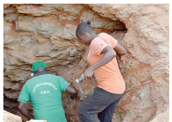
Two miners going down a deep subterranean tunnel in one of the mining zones in Mwatate Sub-county.

Being a highly controlled substance, the use of explosives in the mines is ille-