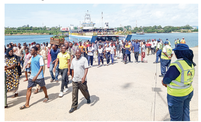
Passengers disembark from MV Safari at the Likoni Crossing channel in Mombasa during peak hours.

"The efficient provision of ferry services continues to be a crucial component in moving people and