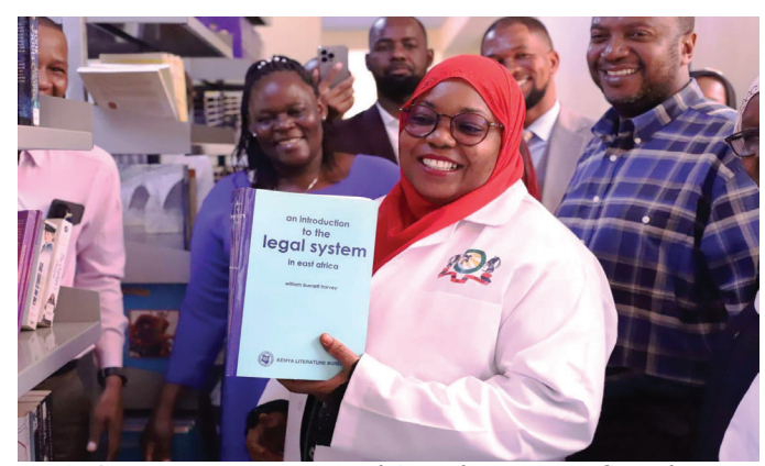
Kwale Governor Fatuma Achani (wearing red scarf) during the commissioning of the Kwale public library. Achani says the community libraries are aimed at promoting literacy, education, and lifelong learning among the citizenry.

She also emphasized the importance of reading in fostering critical thinking, creativity, and personal growth, and urged the public to take advantage of the library's