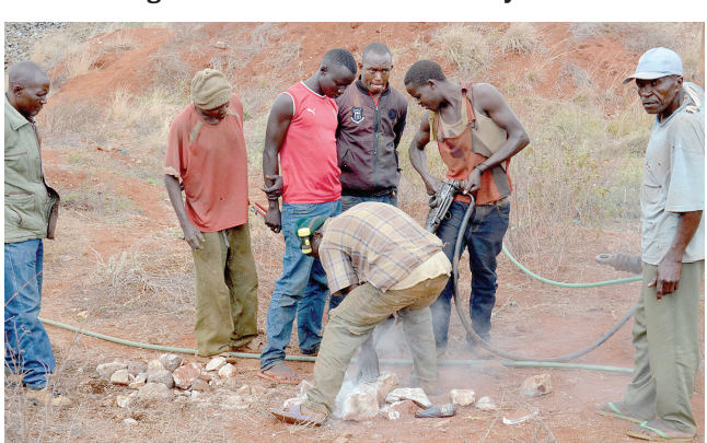
A section of artisanal miners at Chawia in Mwatate use a jackhammer, to rip through a rock in search of precious

gal. Mining officials cite the grave dangers associated with untrained personnel handling these deadly products. Currently, there are no registered explosives' experts or licensed blasters in the region. Nonetheless, the use of explosives by desperate miners continues unabated.