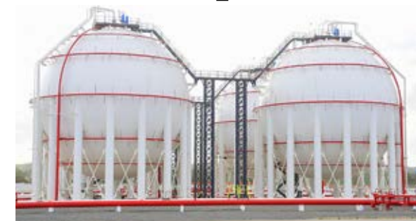
Construction of the ultra-modern LPG firm Lake Gas in Vipingo in its final stages.