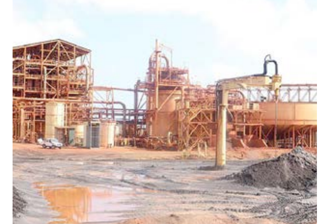
Base Titanium mining in Msambweni Kwale

The Governor contended that the inordinate delay in releasing the royalty cash means that the rich mineral endowment has failed to translate the mineral wealth into overall economic development for the devolved units.