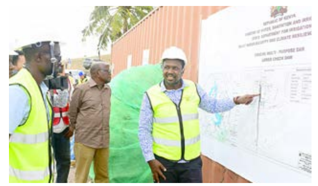
Cabinet Secretary (CS) for Water Eng. Eric Mugaa (L) is taken through the structural design of the Mwache lower check dam when he toured the project in Kinango Sub-County, Kwale.

This initiative follows residents' concerns about