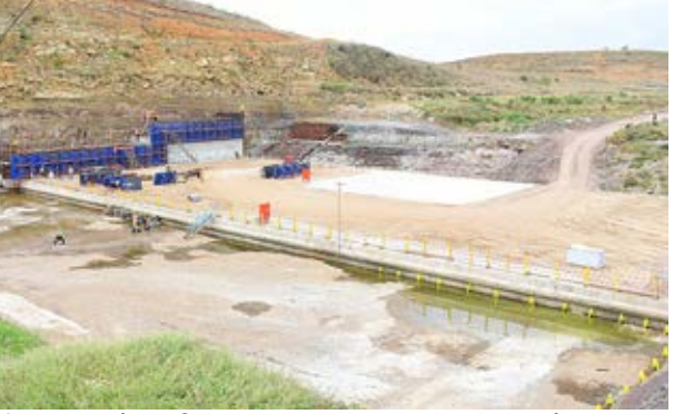
Construction of the Mwache lower check dam in progress in Kinango Sub-County, Kwale.

why the reconstruction of the schools was not meeting their requirements.