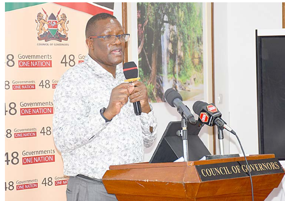
Cabinet Secretary (CS) Ministry of Information Communication and the Digital Economy Eliud Owalo gives keynote address during the high-level meeting between the Council of Governors (CoG) ICT and Knowledge management committee, Senate standing committee on ICT and sector partners at the Pride Inn Hotel, Mombasa.

"We have partnered with the private sector so that in the not so distant future, we are to locally assemble smart enabled phones available in the Kenyan market at a unit cost of about Sh4,000," he said. Owalo added that