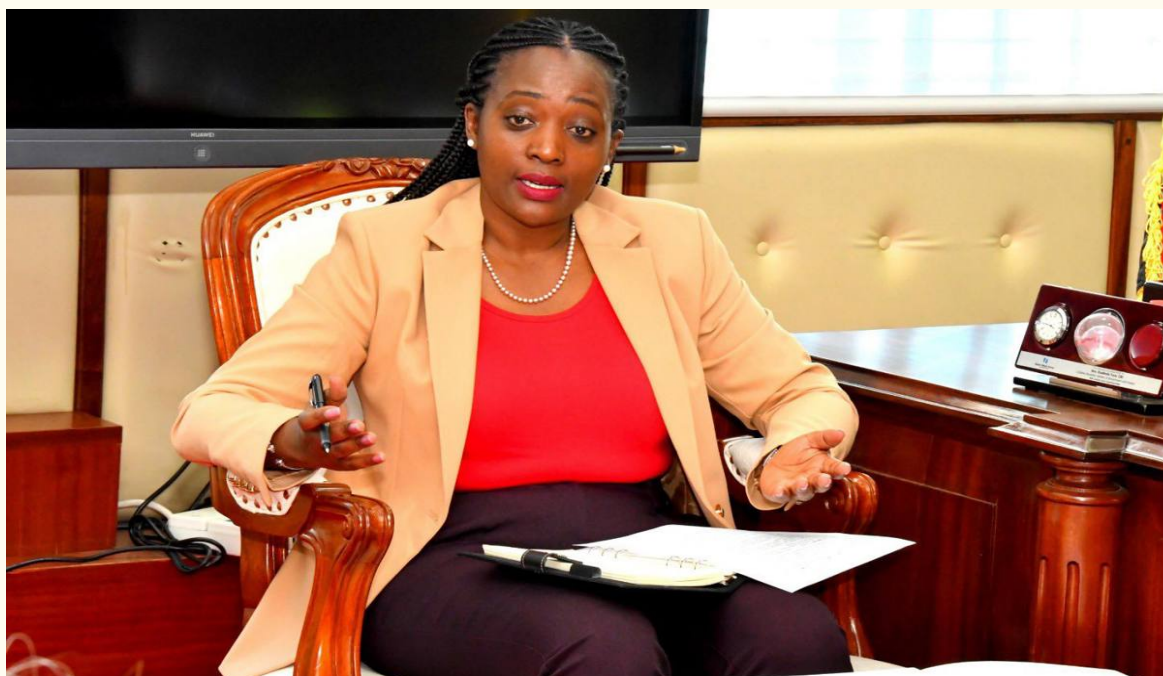
Ms Soipan Tuya, the Cabinet Secretary, Ministry of Environment, Climate Change and Forestry.

A unit of carbon is paid at $10 (Sh1,320) with the biggest beneficiaries being local