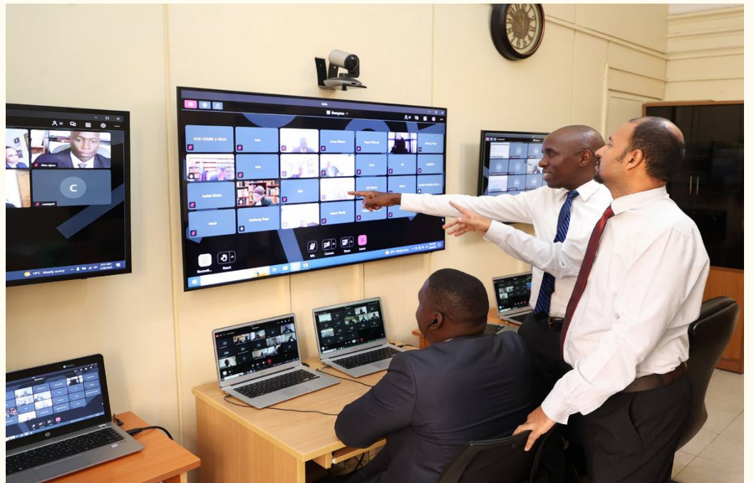
The Court of Appeal when it heard 47 cases and applications as seven Benches sat across the country. The court has adopted a no-adournment policy accelerating the hearing of cases while also utilising digital technology.