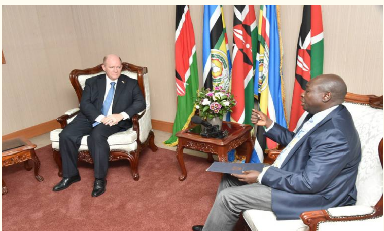
Deputy President Rigathi Gachagua when he hosted a delegation from the US led by Senator for Delaware, Christopher Andrew Coons for consultations on strengthening ties between the two nations in trade, security and democracy. The United States of America is considered a strategic partner for Kenya.