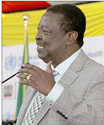
Prime Cabinet Secretary, Musalia Mudavadi speaking during World TB Day, Friday March 24, 2023, Huruma Grounds, Eldoret, Uasin Gishu County.

He urged healthcare service providers to consider doing prescriptions in Swahili language so that the common mwananchi may understand instructions to take medicine doses as prescribed.