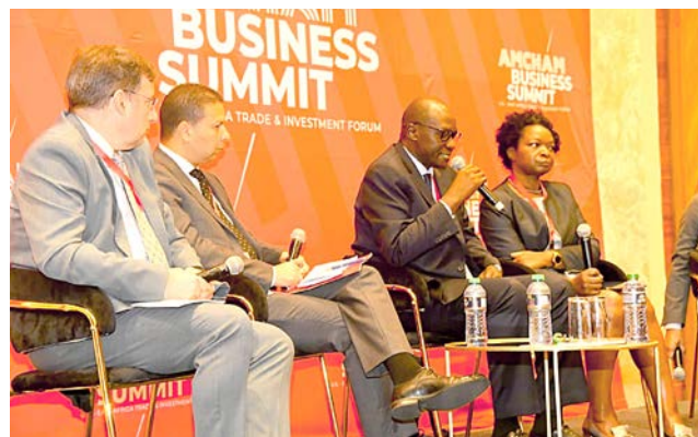
Panelists at the Health Sector Forum discuss strategies for improving healthcare in Kenya during the American Chamber of Commerce Business Summit.