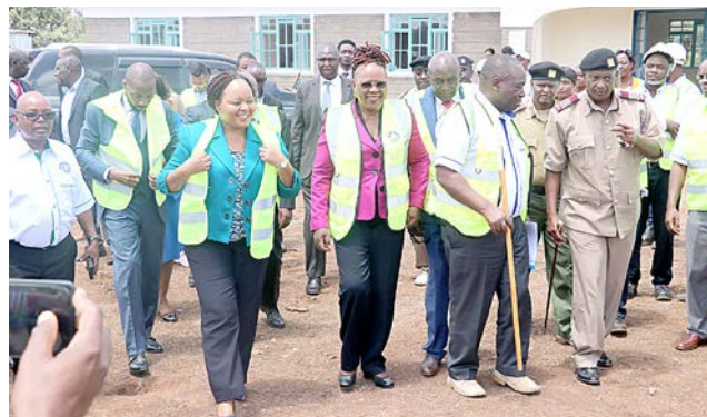
Water, Sanitation and Irrigation Cabinet Secretary (CS) Alice Wahome with Kirinyaga governor Anne Waiguru during her tour of water projects in Kirinyaga county.

The water supply system will draw water from intakes at Kiriga and Thiba rivers, with the main treatment plant located at Mu-