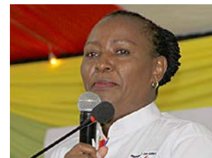
Health Standards and Professional Management PS Dr. Josephine Mburu speaking during the World TB Day 2023 celebration, at Huruma grounds, Eldoret, Uasin Gishu County.

and start contact tracing to help curb the transmission sequence. Noting that the Government's agenda on health is on scaling up preventive and promotive health care at the primary level, Dr. Mburu lauded the County Government of Uasin Gishu for the commendable steps it had taken in establishing proper health infrastructure by investing in TB diagnostic equip-