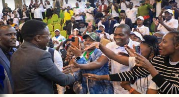
Sports CS Ababu Namwamba during a youth event in Nairobi. He said the government is deliberate, intentional and structured in transforming sports and creative economy into a business.