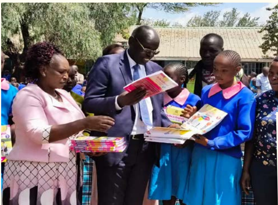
Dr Belio Kipsang, the PS, Basic Education in the Ministry of Education, monitors the distribution of textbooks for Grade 7 students at Arap Moi Primary in Kajiado County on January 30.