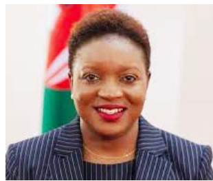
Cabinet Secretary for Health Dr Susan Wafula

Health Cabinet Secretary, Dr. Susan Wafula disclosed that Kenyans will soon enjoy "an end to end" seamless digital health services with more focus and emphasis on Primary Healthcare immediately after the