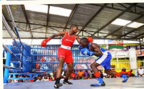
Athletes at the National Boxing Novices Championship at the Umoja 1 Recreational Centre in Nairobi. Sports CS Ababu Namwamba said the government is dedicated to helping young, undiscovered talents from the grassroots level through its #PesaMfukoni drive. The ministry is developing a digital platform named #TalantaHela, which aims to showcase and monetise talent from the grassroots.