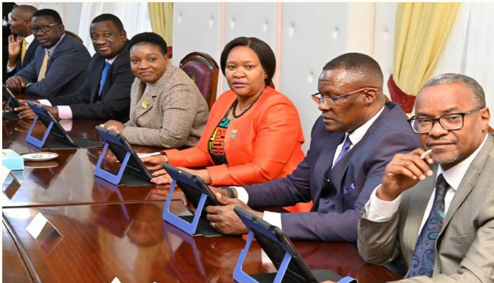
Cabinet secretaries during their first paperless meeting with President William Ruto at State House, Nairobi last week.

The government is expected to offer up to 5,000 services digitally by the end of the year