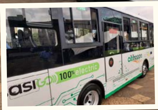
A K6 electric bus run by BasiGo and CitiHoppa. The Sh5 million buses ply the CBD-JKIA route. The buses have a recharging period of less than four hours.