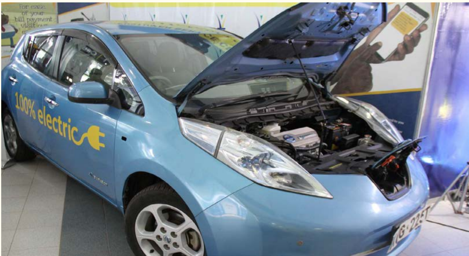
Electrification of the transport sector will reduce vehicular emissions by 3.45 metric tonnes of carbon dioxide by 2030.