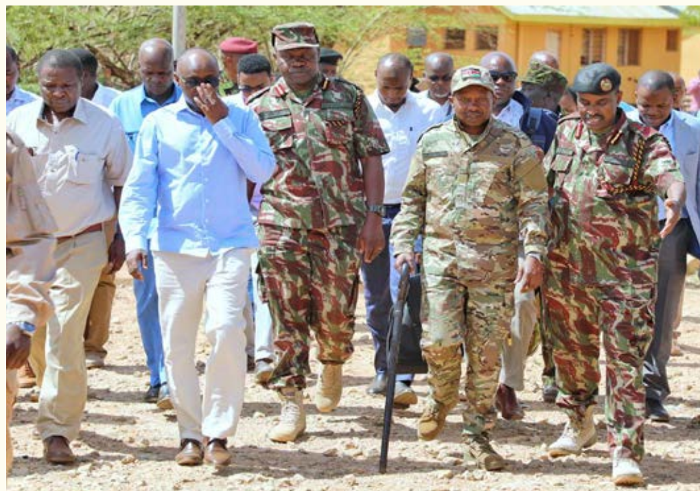
Interior Cabinet Secretary Kithure Kindiki (second right) at the Kenya-Somalia border in Mandera County. There are plans to reopen the border point to curb illegal activities such as smuggling and drug trafficking. The government says it will empower the local community to participate in security operations to counter terror attacks and extremism.