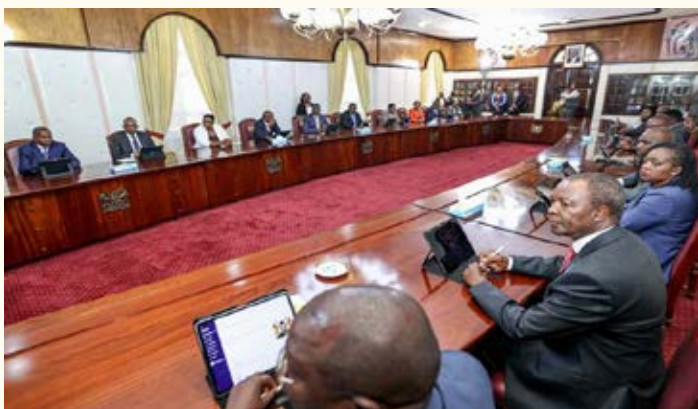
President William Ruto leads the first Cabinet meeting held without paper and pen, launching a major digitisation initiative in the government. The paperless system aligns with the administration's efforts to address climate change.