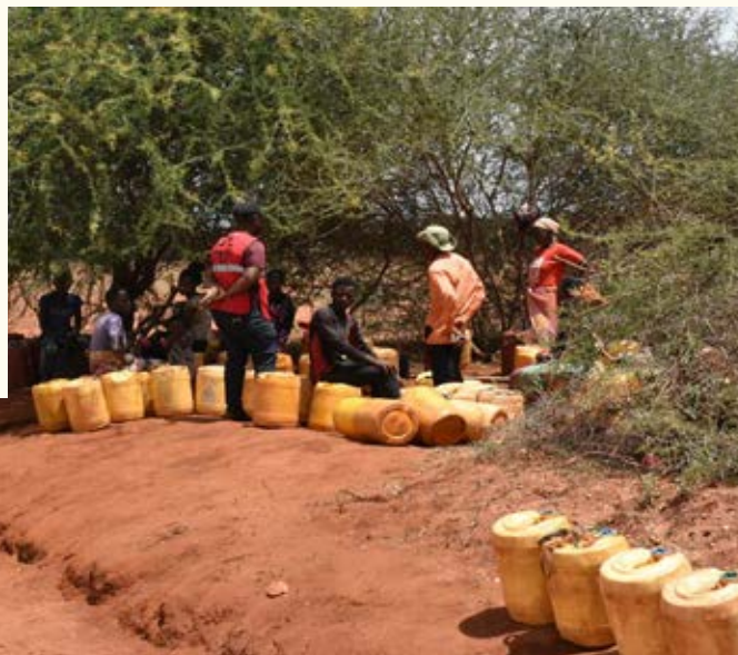
A persistent drought that has hit several parts of the country since last year has reduced access to clean water for both farming and domestic use.

and provide incentives to develop innovative financial instruments such as green bonds, blue bonds, resilience bonds and transactions using carbon credits," said the Treasury.