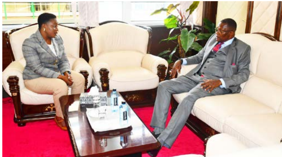
Cabinet Secretary for Health Dr Susan Wafula with her Information, Communication and the Digital Economy counterpart Eliud Owalo, who paid her a courtesy call at her Maji House Office.