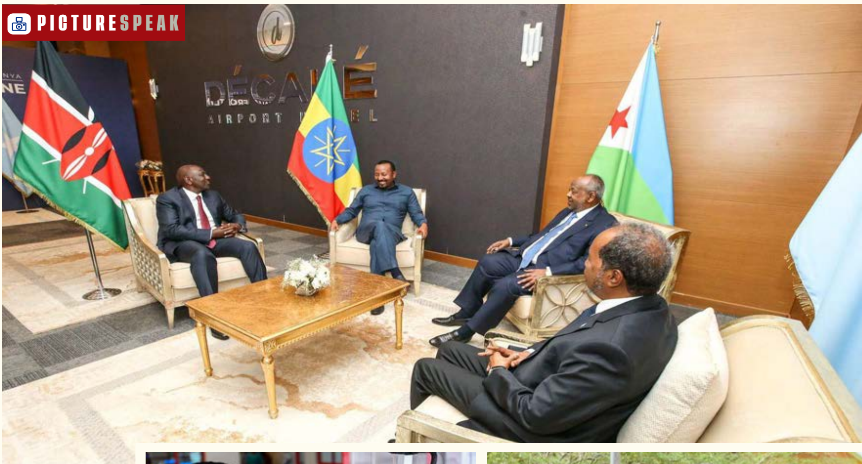
From left, President William Ruto, Ethiopia's Prime Minister Abiy Ahmed Ali, Djibouti's President Ismail Omar Guelleh and Somali's Hassan Sheikh Mohamud at the Somalia Frontline States Summit in Mogadishu on February 1. President Ruto said there is need to enhance law enforcement, intelligence, and financial resources to sustain the progress made by Somalia on the war against terrorism.