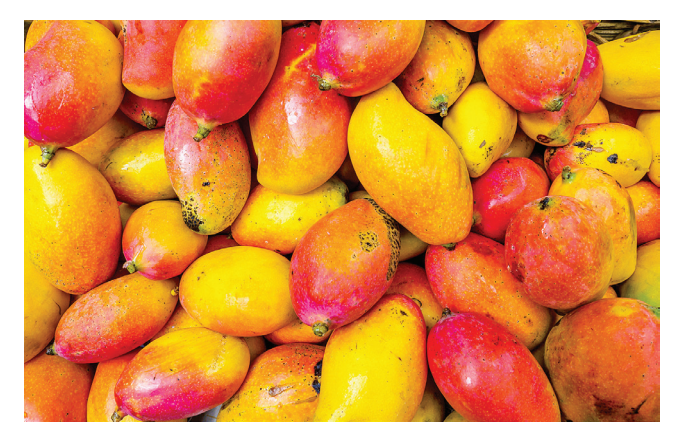
Kenya has gotten approval for export of mangoes to the EU market

"KEPHIS has approved one temperature treatment facility for treatment of mango to the EU and