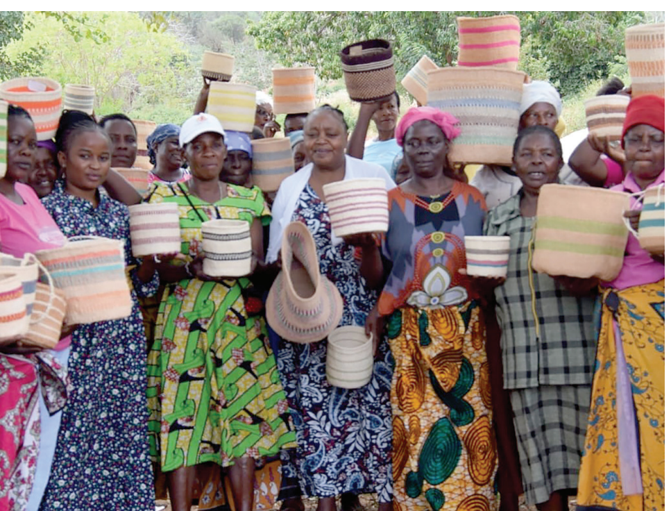
A group of women basket weavers from across Taita Taveta County, showcases their wares after the signing of a global market access deal between the County government and Gitzellfairtrade International.

said the sustainable and global supply chain reaches all markets to ensure competitive prices for the baskets and a trickle-down benefit will be felt at the