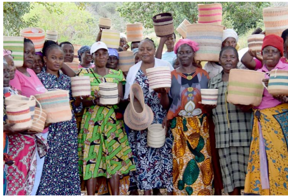
Kundi la wanawake wafumaji vikapu kutoka kaunti ya Taita Taveta, waonyesha bidhaa zao baada ya kutia saina mwafaka wa kuwawezesha kuuza bidhaa hizo katika soko la kimataifa kati ya serikali ya kaunti na shirika la Gitzellfairtrade International.

"Tunafurahi kutangaza ushirikiano wetu na Serikali ya Kaunti ya Taita Taveta ili kusaidia wanawake kufikia soko kubwa la kimataifa kwa vikapu vyao na tuna