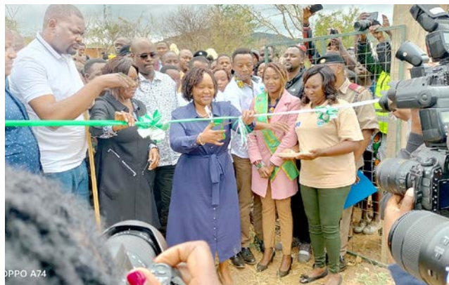
Waziri Rebecca Miano (kati) akizindua bwawa la Andu a Kiome, Embu hivi majuzi

Waziri wa Jumuiya ya Afrika Mashariki, ASALS na Maendeleo ya Kikanda, Bi. Rebecca Miano alisema ingawa mabwawa makubwa yanatataua matatizo ya usambazaji wa maji kwa kiwango kikubwa, umuhimu wa mabwawa madogo katika kutatua shida ya maji katika kijiji hauwezi kupuuza. Miano alikuwa akiongea katika Shule ya Msingi ya Kiamugongo katika Kata ya Muminji, Kaunti ya Embu baada ya kuzindua bwawa la ardhi la Andu a Kiome ambalo litasaidia wakazi wa eneo hilo kupata maji.