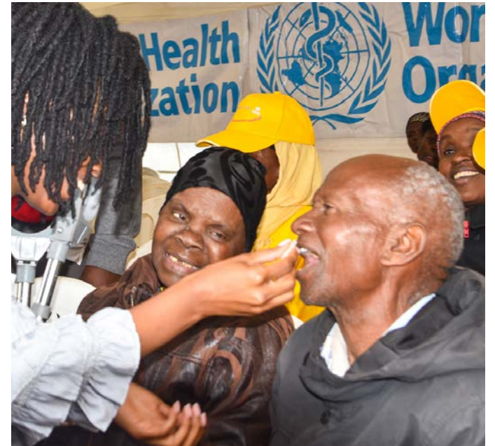
Mkazi apokea chanjo dhidi ya ugonjwa wa Kipindupindu

"Kampeni ya OCV iliyotanzwa Agosti 3, mwaka huu, itapewa kipaumbele majimbo manane yaliyoathirika zaidi, yaani Homa Bay (Suba South), Kajiado (Kajiado East), Marsabit (Moyale), Nairobi (Kamukunji na Embakasi Central), Wajir (Wajir North), Mandera (Mandera East), Machakos, na Garissa",