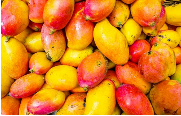
Kenya imepata idhini ya kuuza maembe katika soko la Jumuiya ya Ulaya

"KEPHIS imetoa idhini kwa kiwanda kimoja cha matibabu ya joto kwa ajili ya kusafisha maembe kwa