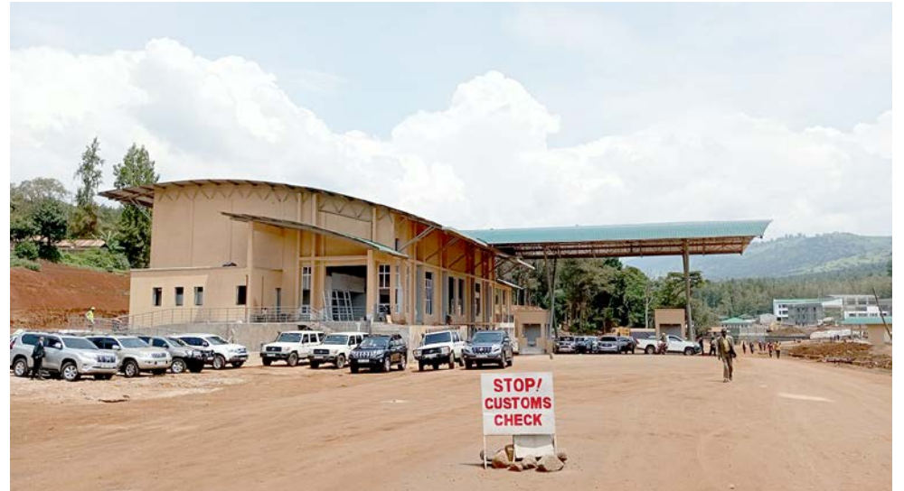
Sehemu ya kituo cha Suam OSPB ambacho kinakaribia kukamilika

Mnamo 2018, Rais mstaafu Uhuru Kenyatta na mwenzake wa Uganda, Yoweri Museveni, walitia saina makubaliano ya ushirikiano wa maendeleo huko Mombasa, kuanzisha Kituo cha Mpaka cha Pamoja ili kuimarisha biashara na usalama.