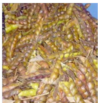
Avokado na mbaazi, ni miongoni mwa mazao KSMS imekuwa ikishughulikia na wakulima kuboresha uzalishaji.

mwaka jana, haijasaidia tu kupunguza umaskini kwa wakulima wadogo bali pia imeshughulikia uhaba wa chakula nchini.