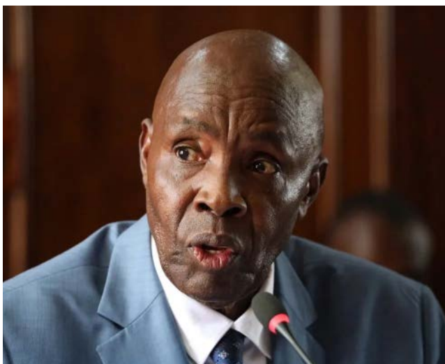
Waziri wa Elimu, Ezekiel Machogu