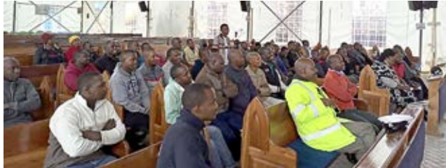
Madereva wa Tuk Tuk wafuatilia mafunzo kwa makini.