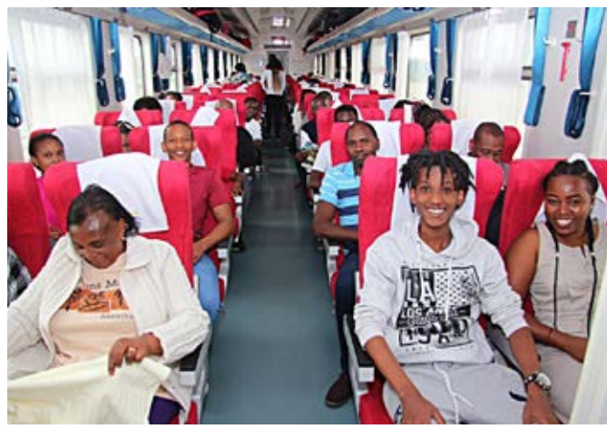
Travellers aboard the Madaraka Express SGR train (FILE)

"In fact, Madaraka Express has revolutionized connectivity in Kenya, bridging the gap between major cities and regions. By linking