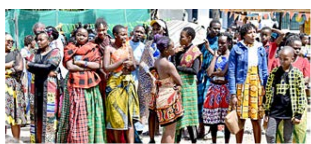
'Children in Freedom School' is unique in that it allows students to use their traditional names while dressing in traditional African attire.