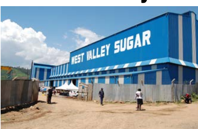
The Kericho based Shs 3.5 billion West Valley Sugar Factory situated in Kapkornom in Soin/Sigowet constituency within Kericho.