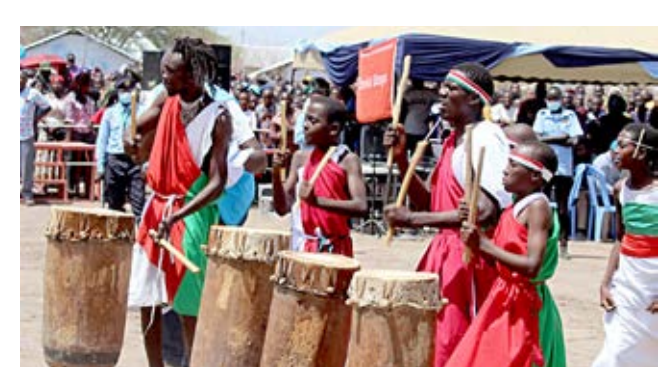
Refugees during the commemoration of the World Refugees day in Kalobeyei Settlement

Speaking during the event, Governor Jeremiah Lomorukai also reiterated honoured to have the County Government of provided support Turkana's commitment to to refugees' supporting refugees.