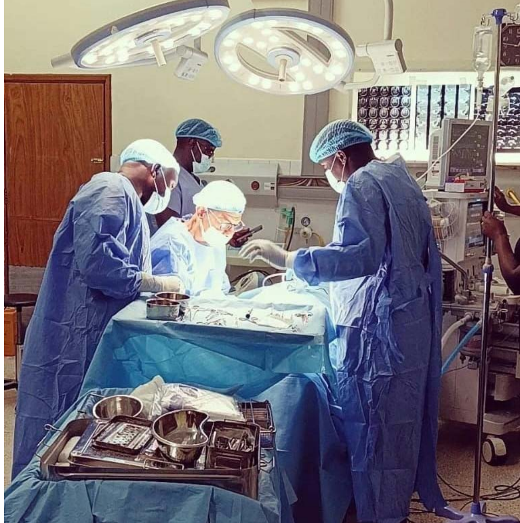
Moi Teaching and Referral Hospital (MTRH) has performed its inaugural Cochlear Implant Surgery. This makes MTRH the first public hospital to undertake the specialist surgery in East and Central Africa region.