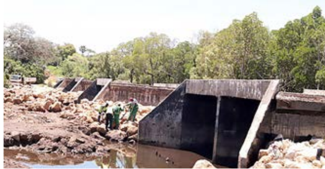
Shughuli za ujenzi wa mradi wa Funzi Island Causeway katika Kwale unaendelea kushika kasi.

kutoka Milalani-Munja (UR 16B) unatarajiwa kukamilika ifikapo mwaka ujao. Barabara hii itatumika kama kiunganishi pekee