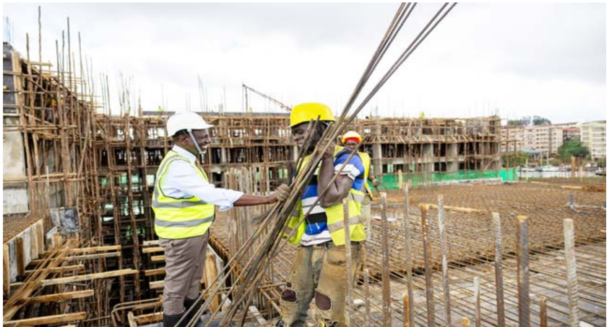
Rais William Ruto atembelea eneo la Soweto Zone 'B' mtaani Langata, Nairobi kukagua shughuli ya ujenzi wa nyumba za gharama nafuu karibu na mtaa wa mabanda wa Kibra.