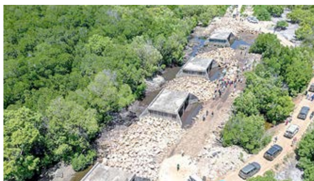
Picha ya angani ya mradi wa kifahari wa Funzi Causeway, Kwale ambao unaendelea kwa kasi ili kuimarisha uchukuzi na usalama.

Kikiwa na visiwa vinne vilivyofunikwa na mikoko, Kisiwa cha Funzi ndicho kikuu chenye wakaaji wa kudumu. Eneo la Funzi Causeway, lenye urefu wa mita 500 na barabara ya kilomita mbili, linaahidi ufikiaji wa umma kwa wakazi wa visiwani hadi Pwani ya bara. Ujenzi wa barabara ya Funzi Causeway yenye thamani ya Sh1.15 bilioni