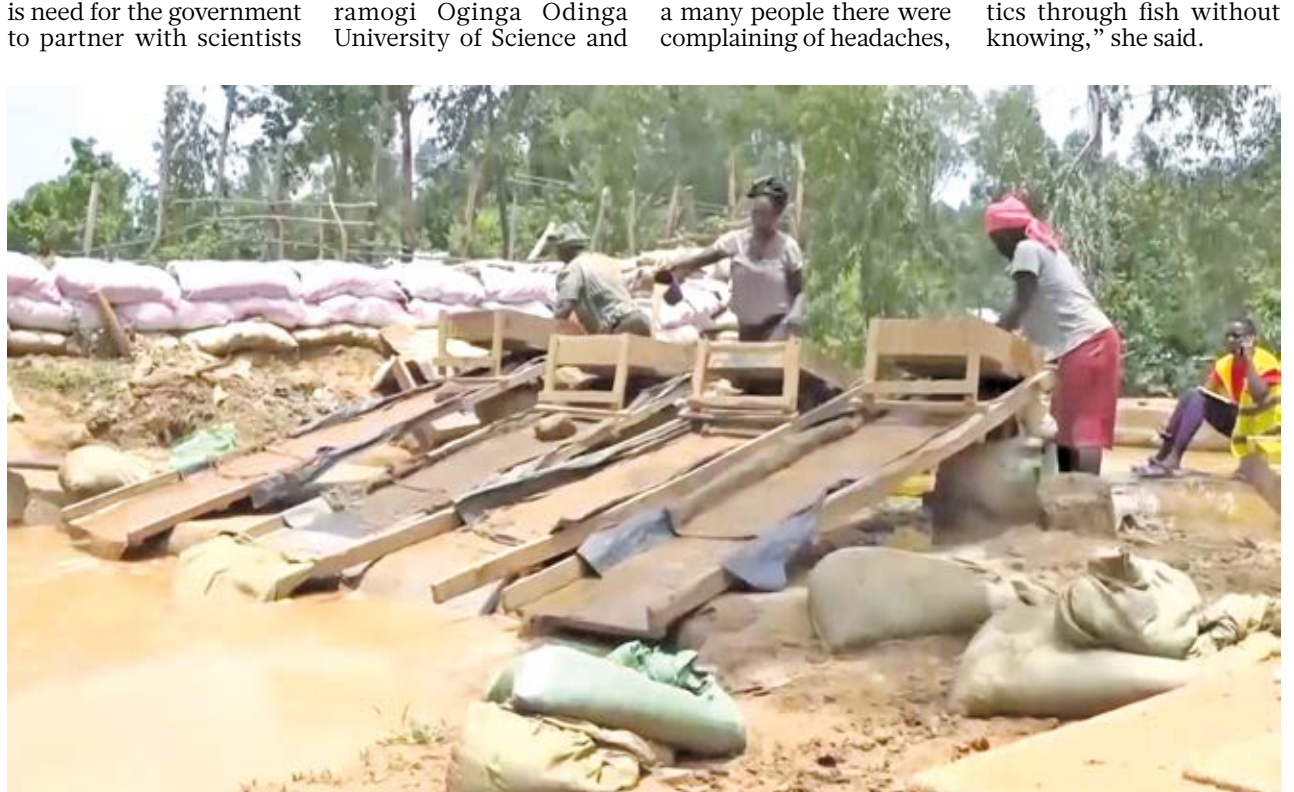
Women processing raw ore at a gold mining site in Siaya. KCS calls for strict regulation of mining waste disposal

She called on the public to support government efforts to manage plastic waste. "You could be feeding on micro plastics through fish without knowing," she said.