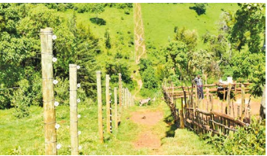
Maasai Mau Water Tower