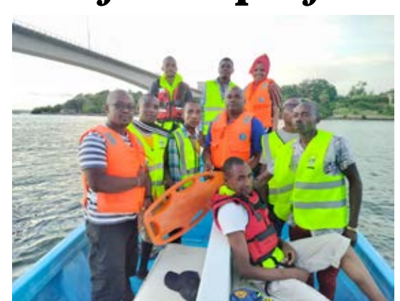
Kenya Maritime Authority (KMA) staff during the launch of a four-year project supporting the manufacture of local quality and standard life jackets.