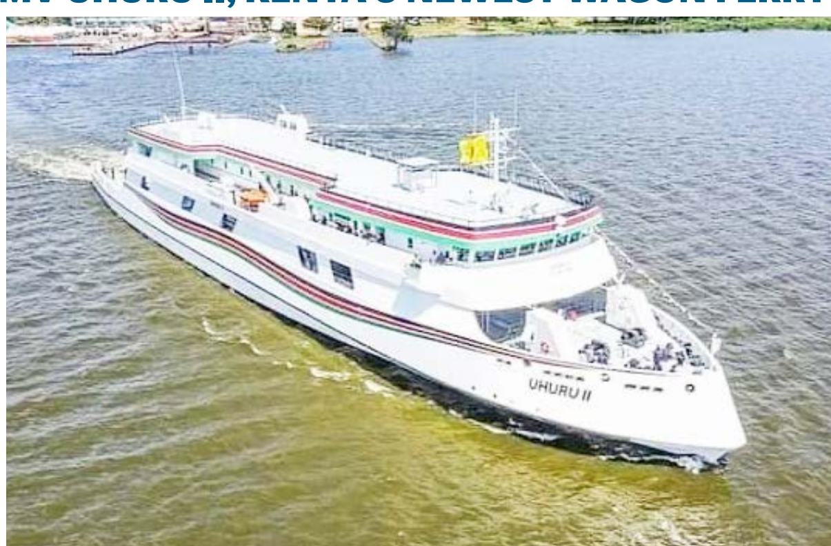
The Sh 2.4 billion MV Uhuru II was assembled locally by Kenya Shipyards Limited (KSL). The 100m vessel has a capacity of 2 million litres of crude oil per trip and 1,800 tons.