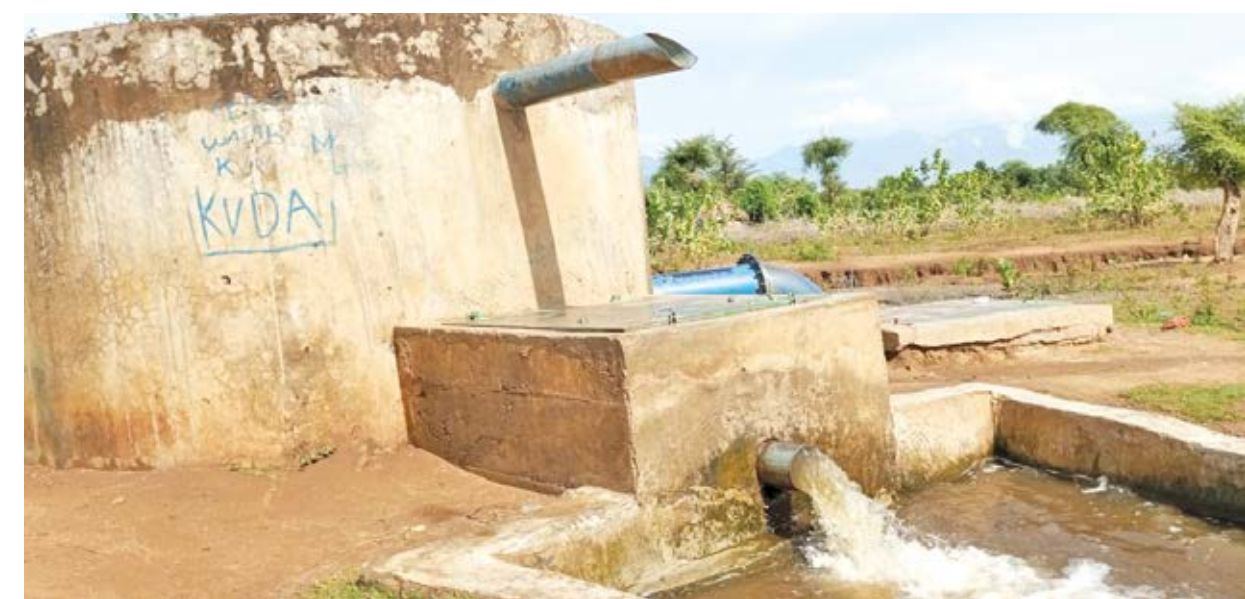
The Muk dam, one of the rehabilitated sections in the Southern Dune within the precincts of Mining Firm Base

These initiatives demonstrate the company's ongoing commitment to supporting local communities through education and infrastructure development, fostering long-term social impact beyond their mining operations.