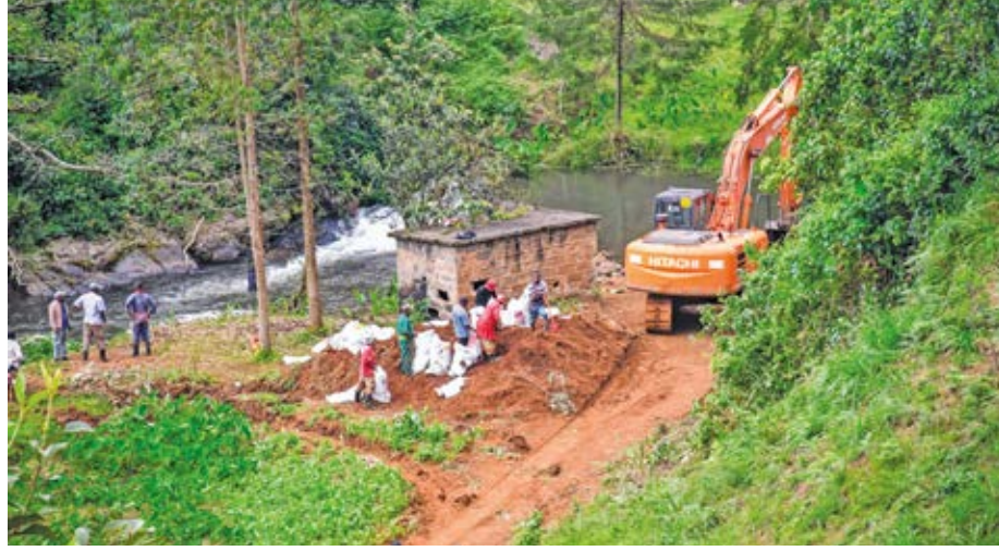
Kaihi Irrigation Project commences in Kangema.

"Apart from working in this project as a casual laborer where I am able to put food on the table for my family, I am excited that I will be able to practice profitable farming of bananas, French beans and tomatoes using the