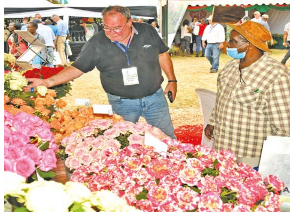
Farmers drawn from across the country tour a flower themed exhibition showcasing the latest innovations in the industry.