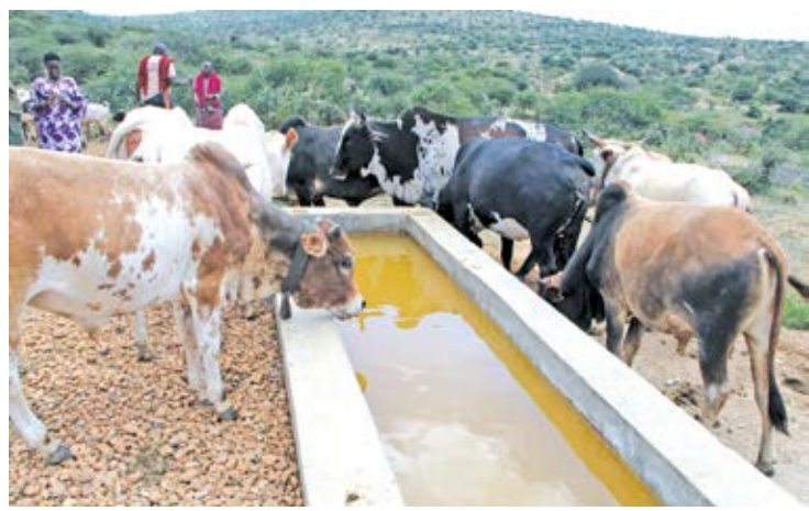
Livestock drinking water in Luruk community borehole, Laikipia County.

Walda Integrated Agro-pastoralism feedlot project which will cost Sh27 billion in Marsabit County and being implemented by Ewaso Ng'iro North Development Authority will be under 12,000 acres of land benefitting more than 1,000 livestock keep-